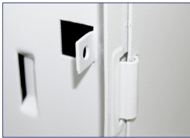
Flush Mount Door