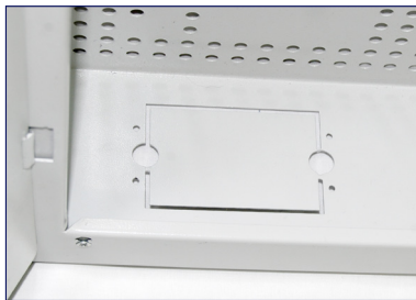
Three GPO Knock Outs